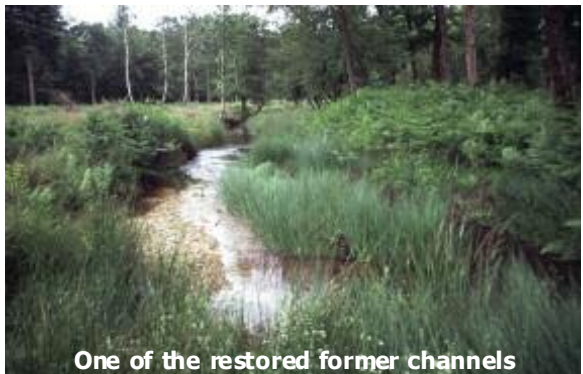
One of the restored former channels