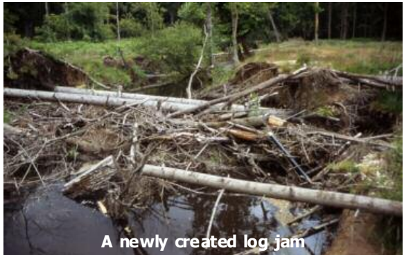
A newly created log jam

Background The New Forest has the highest recorded density of debris dams in Britain. It contains some of the most important and rare wetlands in Europe including spectacular stands of riverine woodland, bog woodland and valley mires. However, many watercourses were re-sectioned and large areas drained for timber growing and livestock grazing.